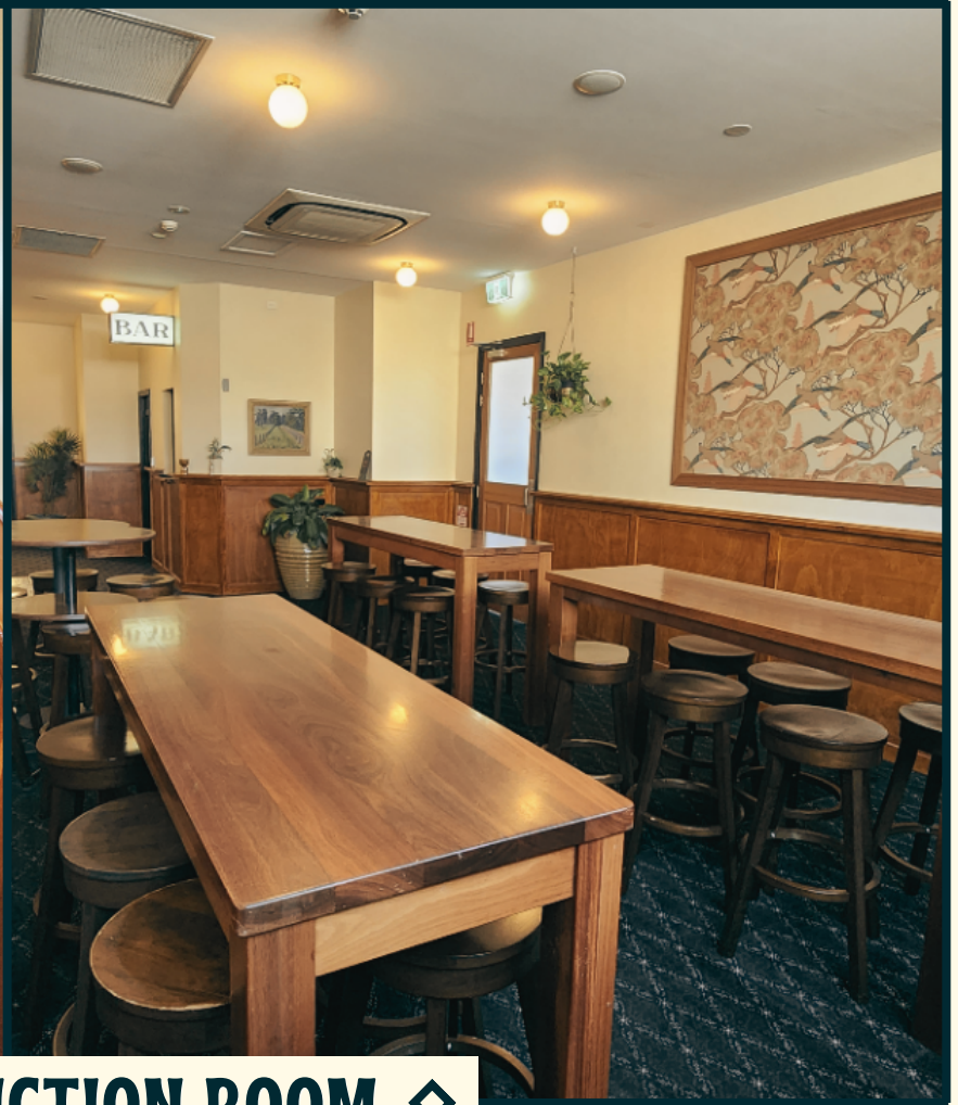
◆ FUNCTION ROOM ◆